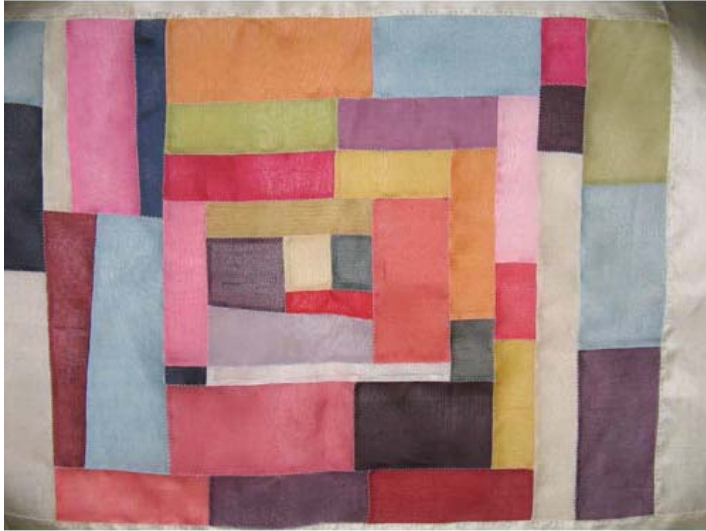
Bong Hwa Kim In the Garden II, 2002 Silk